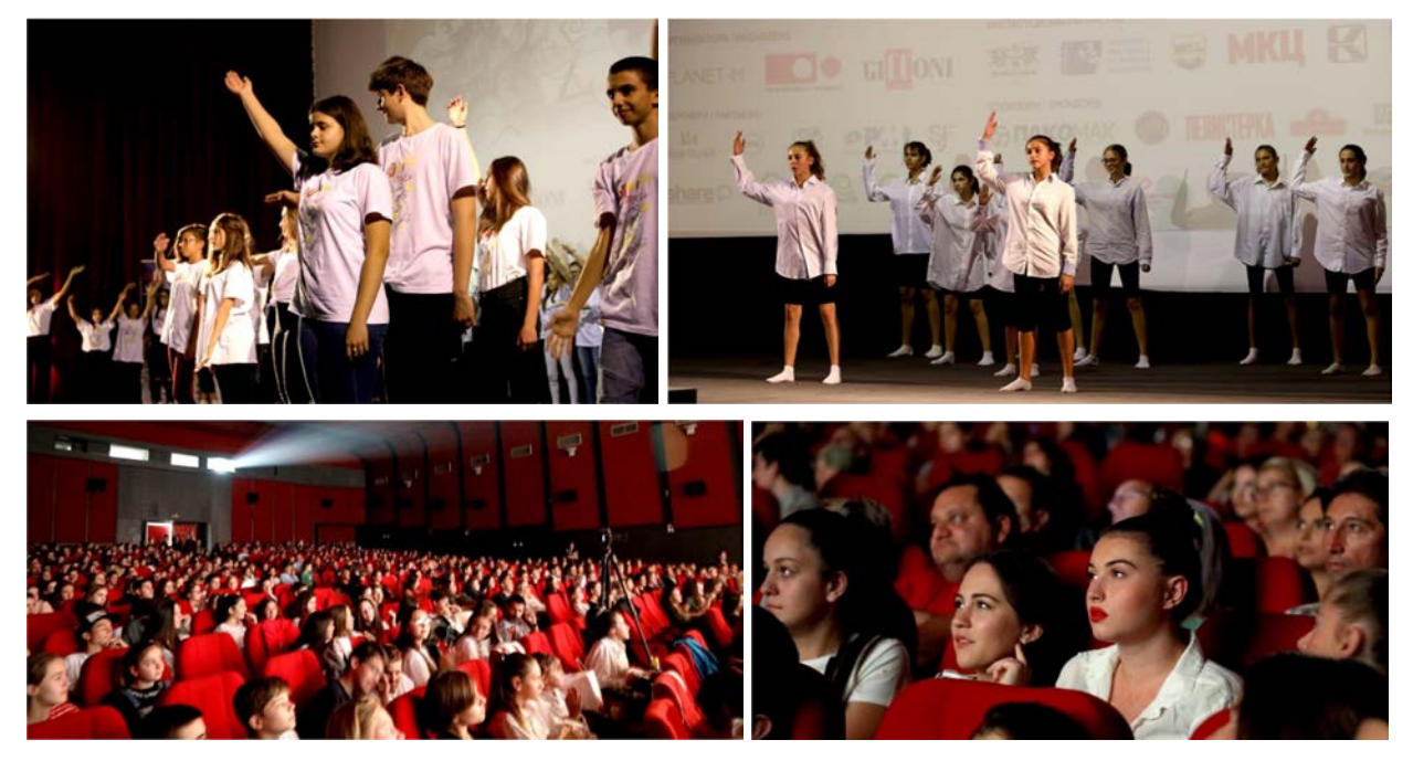
Six short feature films from the film workshop and six short animations were shown, as well as two one-take videos produced during workshops were broadcasted on the big screen.

A small theatre play with over seventy juniors was performed as a result of the theater workshop under the mentorship of Tea Begovska, and the juniors from the workshop for modern dance led by the ballet studio Bulfrog prepared a modern dance to a musical track.